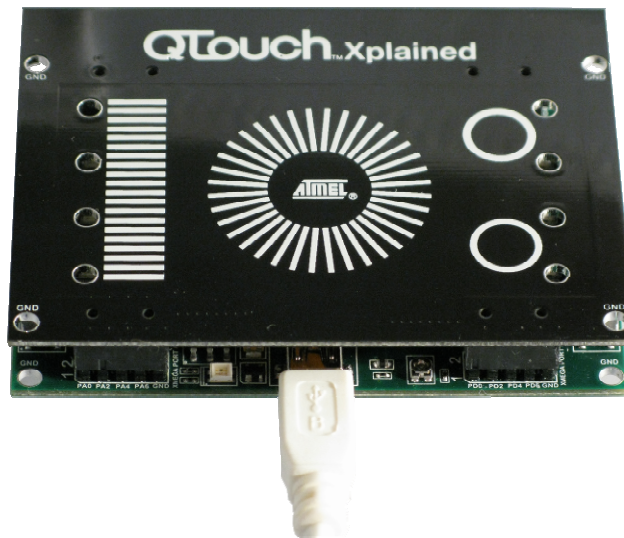
Figure 2-2 Connecting the QTouch Xplained & Xplain to the PC